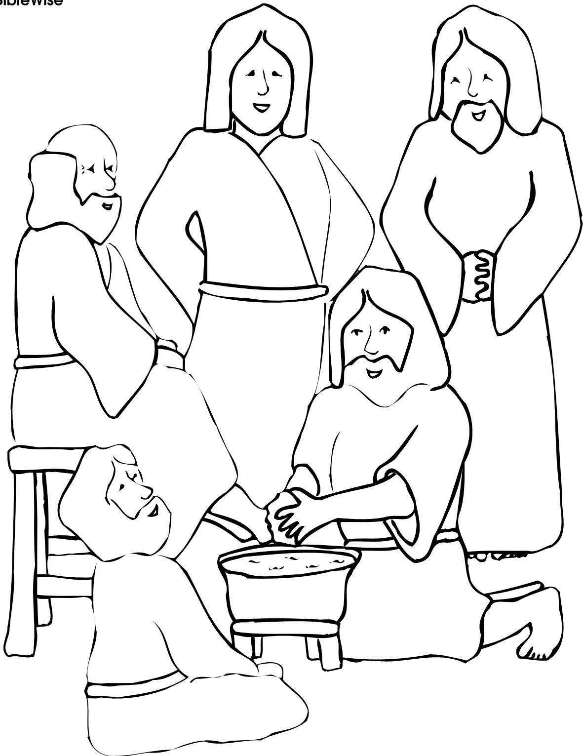
Jesus washing his disciples' feet